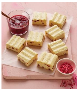
White Chocolate and Raspberry Tray Cake 2kg