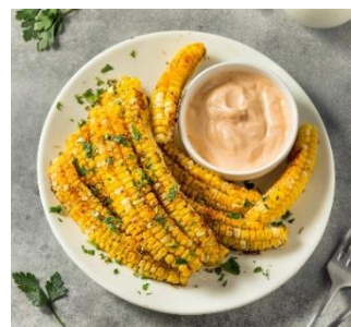
Corn Ribs 1.5kg