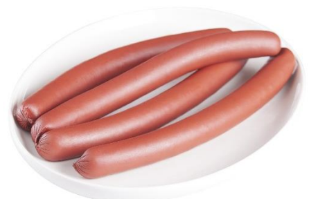
Chapmans Kabanos 2.5kg