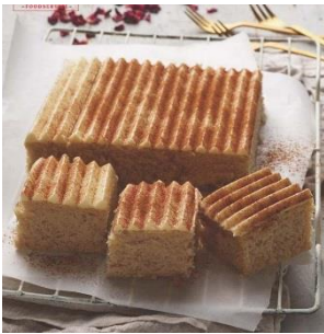
Banana Tray Cake 1.8kg