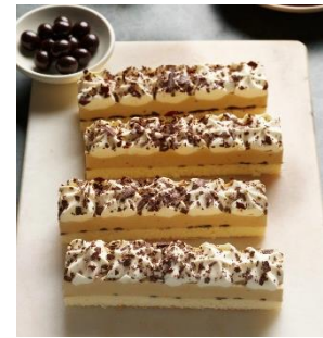
Tiramisu Cake Tray 1.35kg