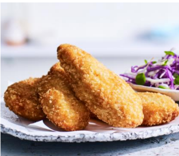
Salt and Vinegar Tenders 1kg