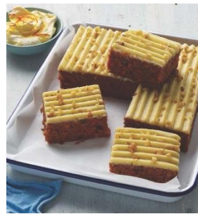
Carrot Tray Cake 2.25kg