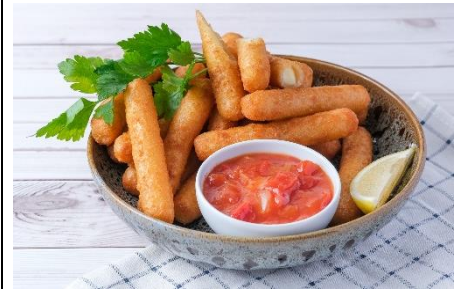
Beer Battered Mozzarella Sticks 1kg