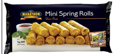
Marathon Mini Beef Spring Rolls (20 pieces)