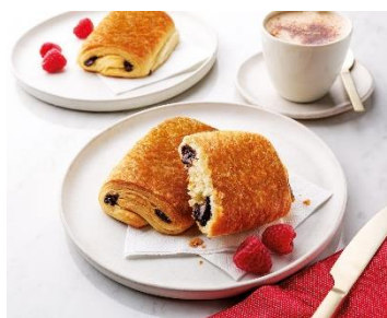
Pain Au Chocolat Croissants 3x75gm