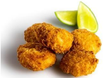
Panko Crumbed Scallops 1kg