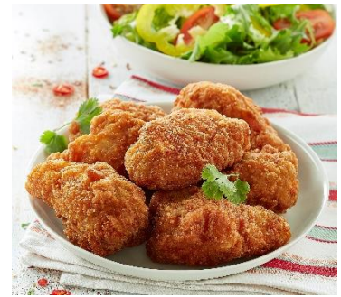
Devil or Plain Wing Dings 1kg