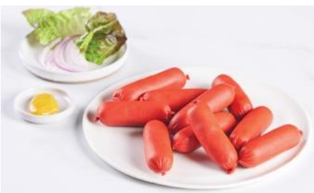
Cocktail Frankfurts 2.5kg