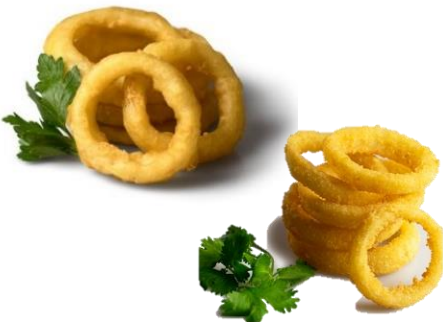
Beer Battered or Panko Crumbed Onion Rings 1kg