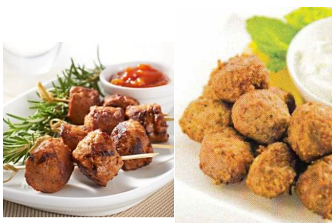
Flame Grilled or WAGYU Gourmet Beef Meatballs 1kg