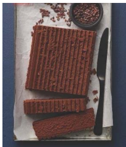
Chocolate Tray Cake 1.8kg