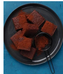
Chocolate Brownie Tray 1.6kg