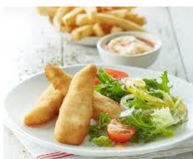
Classic Crumbed Tenders 1kg