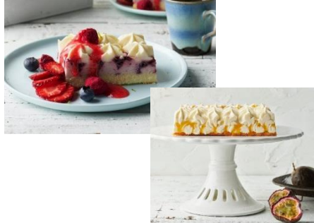
Mixed Berry or Peach and Mango Cheesecake Tray 1.35kg