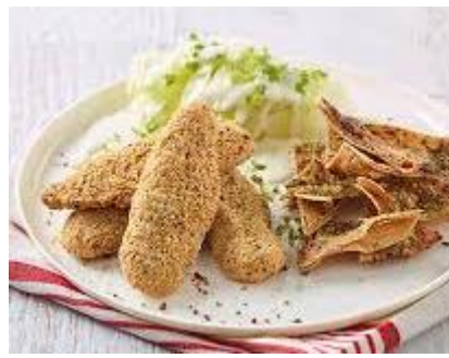
Southern Style Tenders 1kg