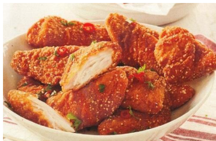
Devil Boneless Wyngz 1kg