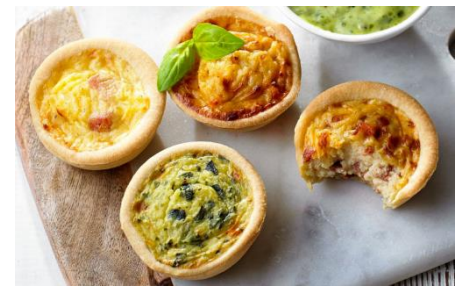
Party Quiche Combo (Quiche Lorraine, Cheesy Chorizo, Spinach & Feta) (4doz)