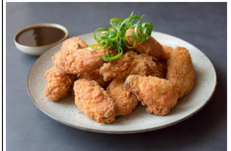
Korean Fried Chicken Wings (approx. 17 pieces) 1kg