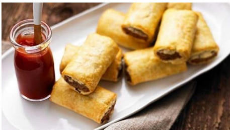
Party Sausage Rolls (4 Doz)