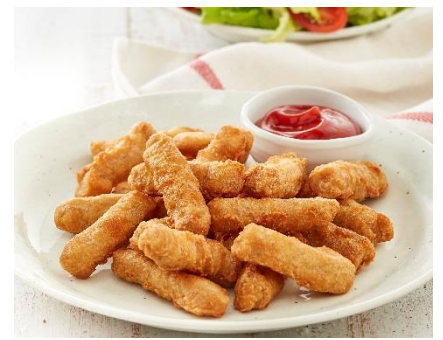
Chicken Chips 1kg