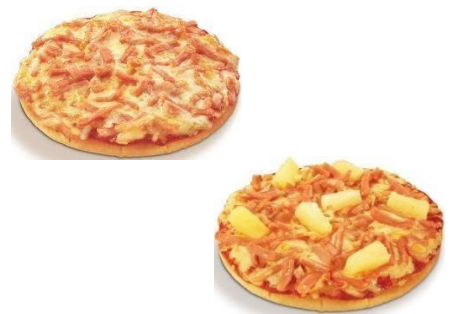
Ham and Pineapple or Cheese and Ham Pizza Singles (32 pieces)