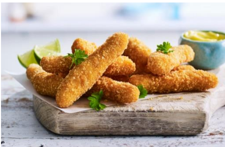
Crumbed Breast Goujons 1kg