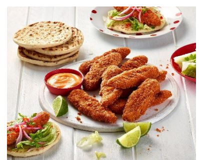
Devil Tenders 1kg