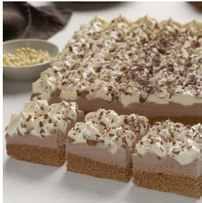
Chocolate Bavarian Cheesecake Tray 1.15kg