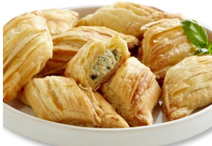
Mini Spinach & Fetta Pastizz (2 Doz)