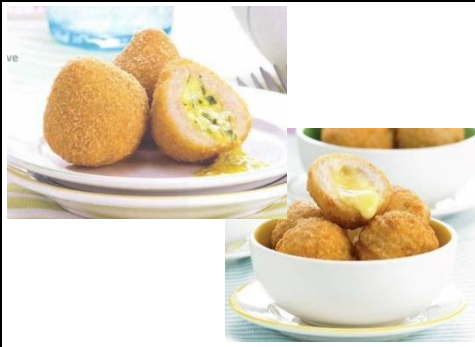
Chicken Garlic or Chicken Cheese Balls 1kg