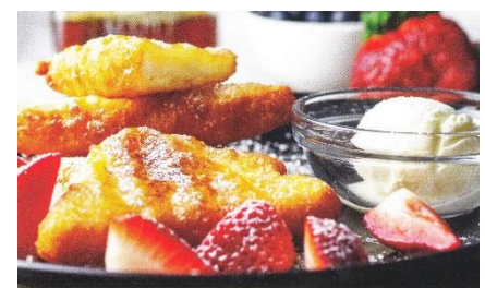
Crispy Cinnamon Toast 1kg