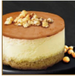
Individual Salted Caramel Cheesecakes 8x95gm