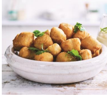
Chicken Breast Crackles 1kg