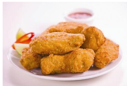
Flaming Wing Nibbles 1kg