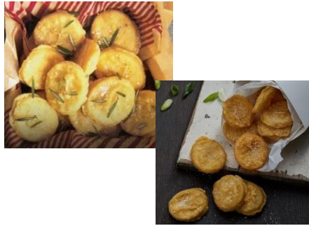
Salt and Vinegar or Plain Mini Potato Cakes 395 Pieces