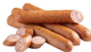
Kabana (Dons) RW product (Approx 4kg) or 375gm pk