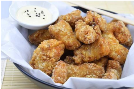
Karaage (Japanese Crispy) Chicken 1kg