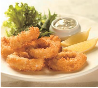
Panko Crumbed Squid Rings 4kg