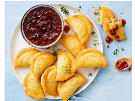
Party Pasties (4 Doz)