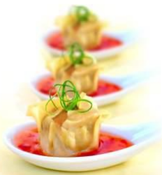
Mini Chicken Dim Sims (55 pieces)