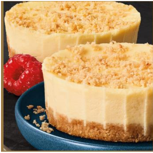
Individual New York Baked Cheesecakes 8x80gm