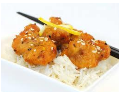
Battered Chicken (or Pork) Pieces 1kg and 5kg