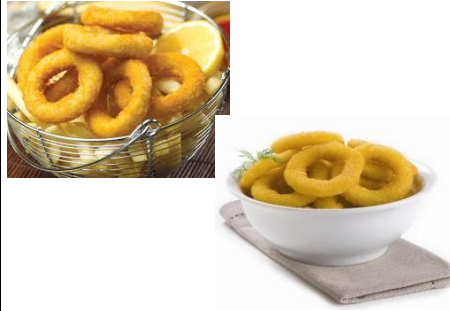
Crumbed Squid Rings Formed or Genuine 1kg