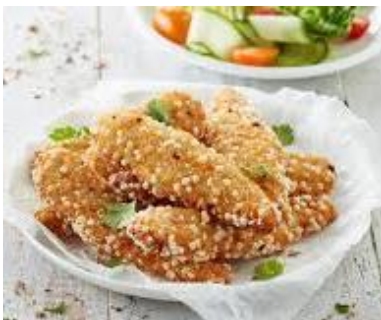
Sweet Chilli Tenders 1kg