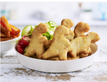
Dino Snacks (Breast Nuggets) 1kg