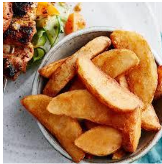
Seasoned Wedges 2kg