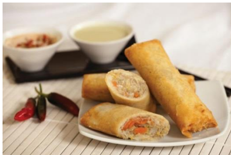
Royal Dragon Spring Rolls (2 Doz) V