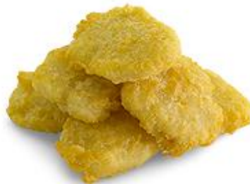
Fish Cocktails 1kg