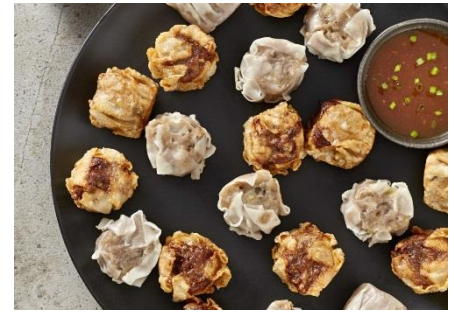
Mini Beef Dim Sims (5 Doz)