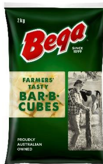
Tasty Cheese Cubes 2kg