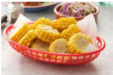
Ready to Roast Corn Cobbs 2kg