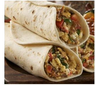
6" Flour Tortillas 1doz