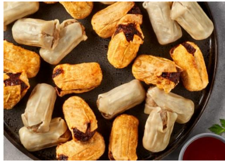
Dim Sims (5 Doz)