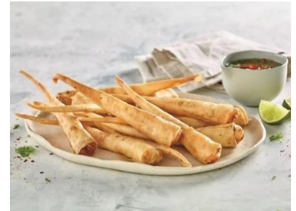
Prawn Twisters 1kg