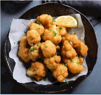
Popcorn Cauliflower 1kg