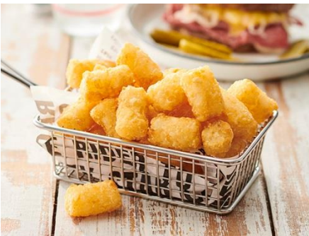
Potato Gems 2kg