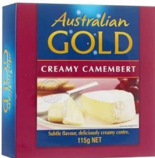
Camembert Wheel 115gm