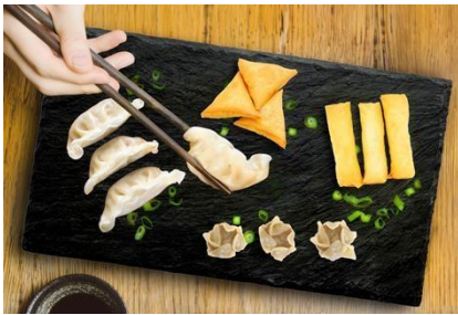
96x Cocktail Spring Rolls, 96 x Cocktail Samosas, 53 Beef Dim Sims, 50 x Chicken and Mushroom Dumplings