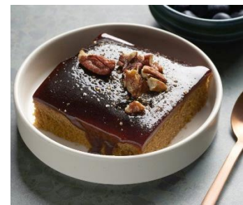
Sticky Date Pudding Tray 1.15kg