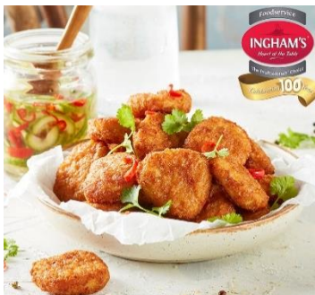
Chicken Teriyaki Medallions 1kg