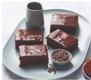
Chocolate Mud Cake Tray 2kg