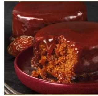
Individual Sticky Date Puddings 8x90gm