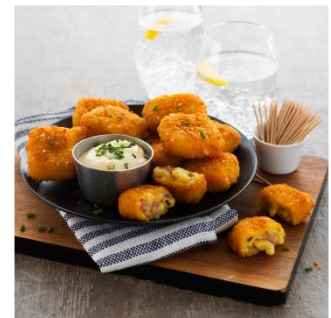
Mac & Cheese Bites 1kg