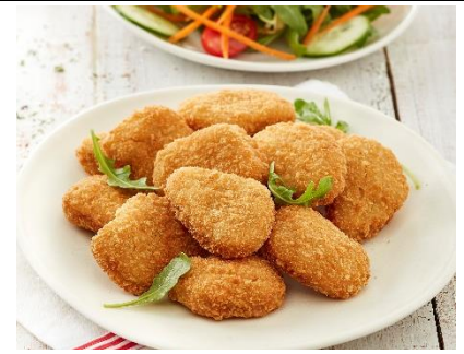
Crumbed Chicken Nuggets 1kg (Breast or Gluten Free)