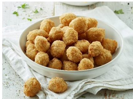
Pop 'Em Chicken Southern Style 1kg