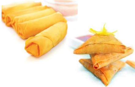
Cocktail Spring Rolls or Cocktail samosas (8 Doz) V