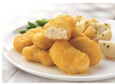
Tempura Battered Chicken Breast Nuggets 1kg