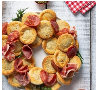
Party Pies (4 Doz)