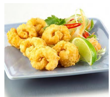
Salt and Pepper Squid 1kg