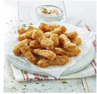
Country Crisp Chicken Strips 1kg