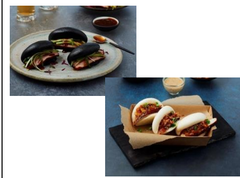
Bao Buns White or Charcoal 15x32gm